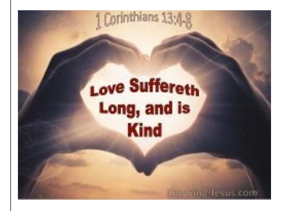
Rev'd John's Sermon Outline

The Biblical Virtues of Love. THE MORE EXCELLENT WAY.